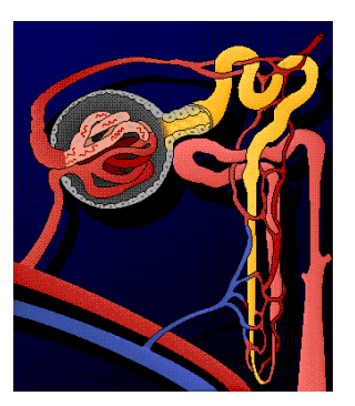
The functional working unit of the kidneys called the nephron